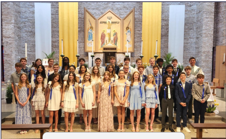
SJB Class of 2025

The month of May is a time of joy and hope as we celebrate many milestones for our students - First Communions, graduations, and the end of the school year. It is also one of two months where we honor Mary in a special way. Today, our 8th graders helped us honor Mary during our May Crowning Mass and also received their graduation ribbons.