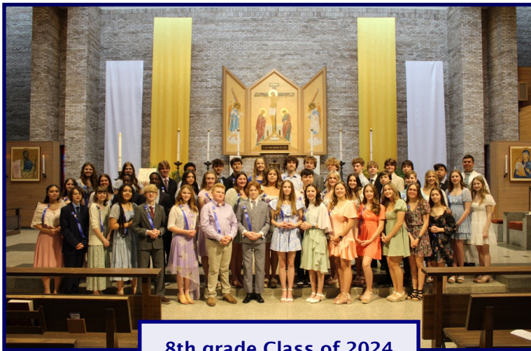
8th grade Class of 2024

The month of May is a time of joy and hope as we celebrate many milestones for our students - First Communions, graduations, and the end of school year. It is also one of two months where we honor Mary in a special way. Yesterday, our 8 th graders helped us honor Mary during our May Crowning Mass and also received their graduation ribbons.