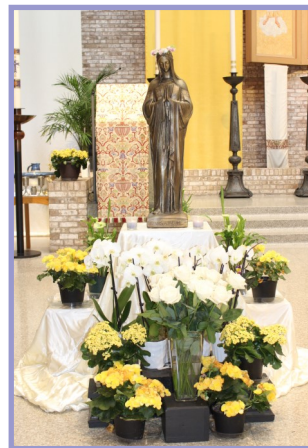
May Crowning 2023