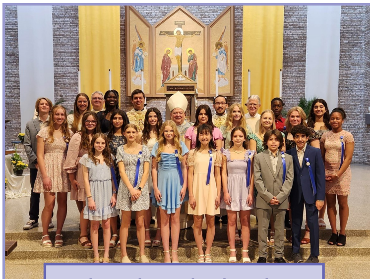
8th Grade Graduating Class