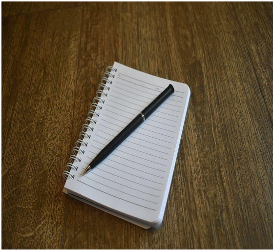
Bringing you the scoop!

Our eight-grade Media class has been working hard all month to bring you the best and latest news from around SJB.