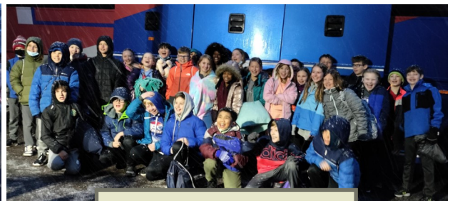
The group - Ready to go!

Below are a few things coming up that we want you to be aware of: