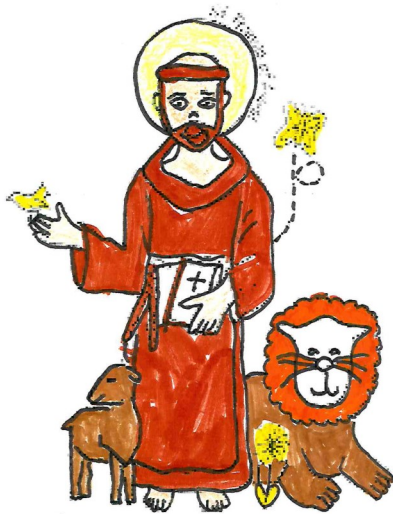
Molly - Kindergarten