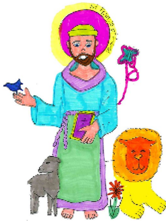
Emma - Grade 1