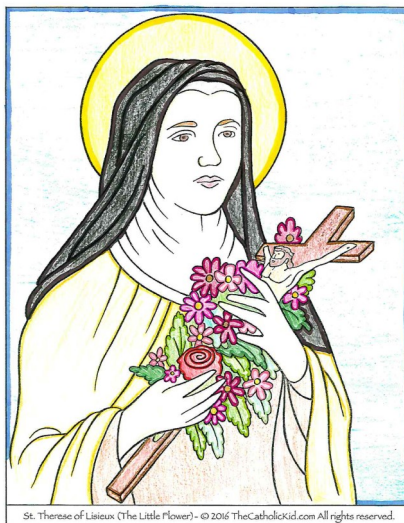
Ayla - Grade 7