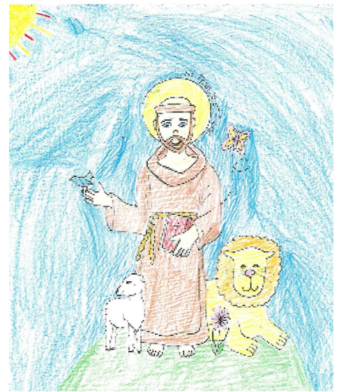
Isabella - Grade 2