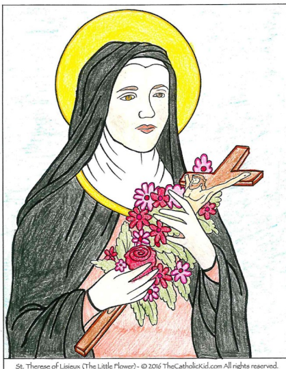
Amelia - Grade 6