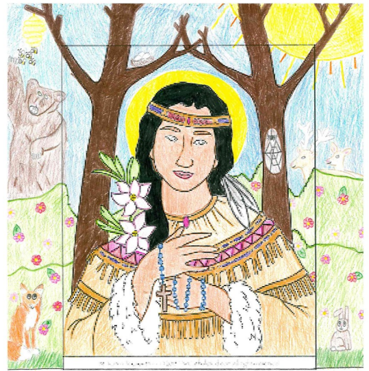
Gabriella - Grade 5