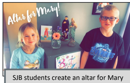
SJB students create an altar for Mary